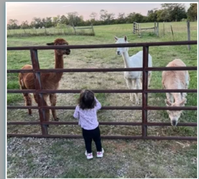
Family night checking out the alpacas