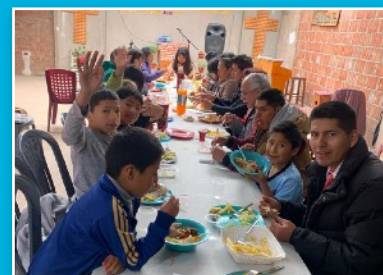
Easter lunch at Faith Baptist