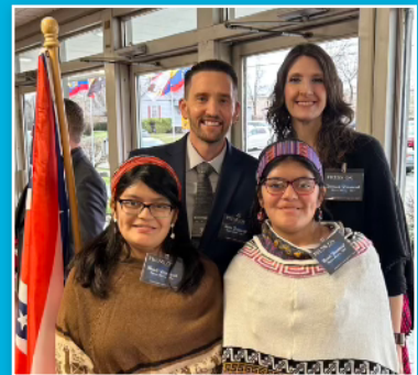
Ready for the parade of nations