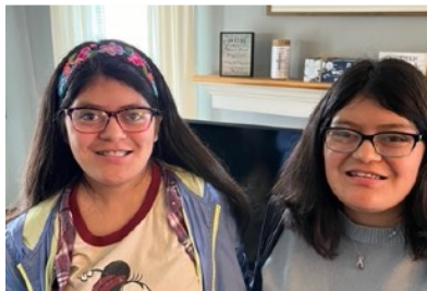
Almost done with 1 year of Grade 23