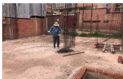
Construction started again in Cusco!