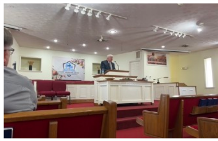
Missions emphasis day in Ky.