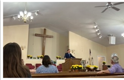
Preaching at our home church