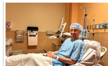
Ready for surgery